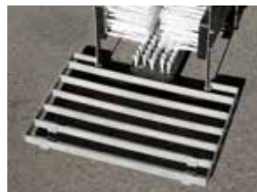
Accessory: Scraper grate for coarse dirt