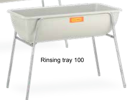
Rinsing tray 100