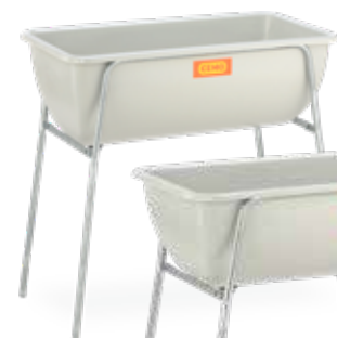
Rinsing tray 75