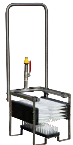
Boot cleaner ECO