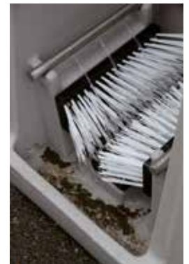
integral sump to collect dirty water and enable disposal with 1 1/2" connection